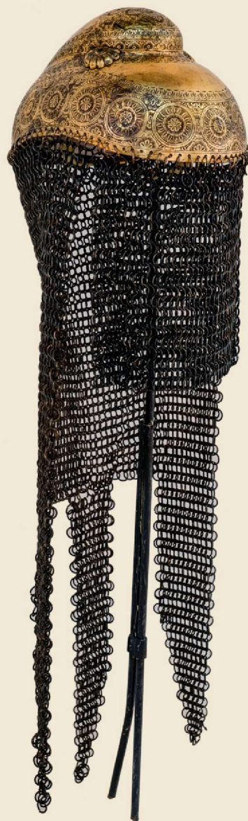
Helmet with chain mail neck-guard. Lahore, Punjab, circa 1820-1840 Helmet of iron overlaid with gold; mail neckguard of iron and brass, Asian Art Museum of San Francisco. Gift of the Kapany Collection, 1998.69.