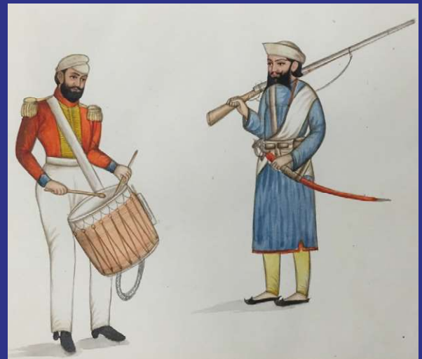
| Sikh drummer of the Fauj-i-khas and Najib of Avitabile's brigade Lahore or Amritsar, 19th century, 21.6 × 17.8 cm, Kapany Collection of Sikh Art (Album 3, page 37)