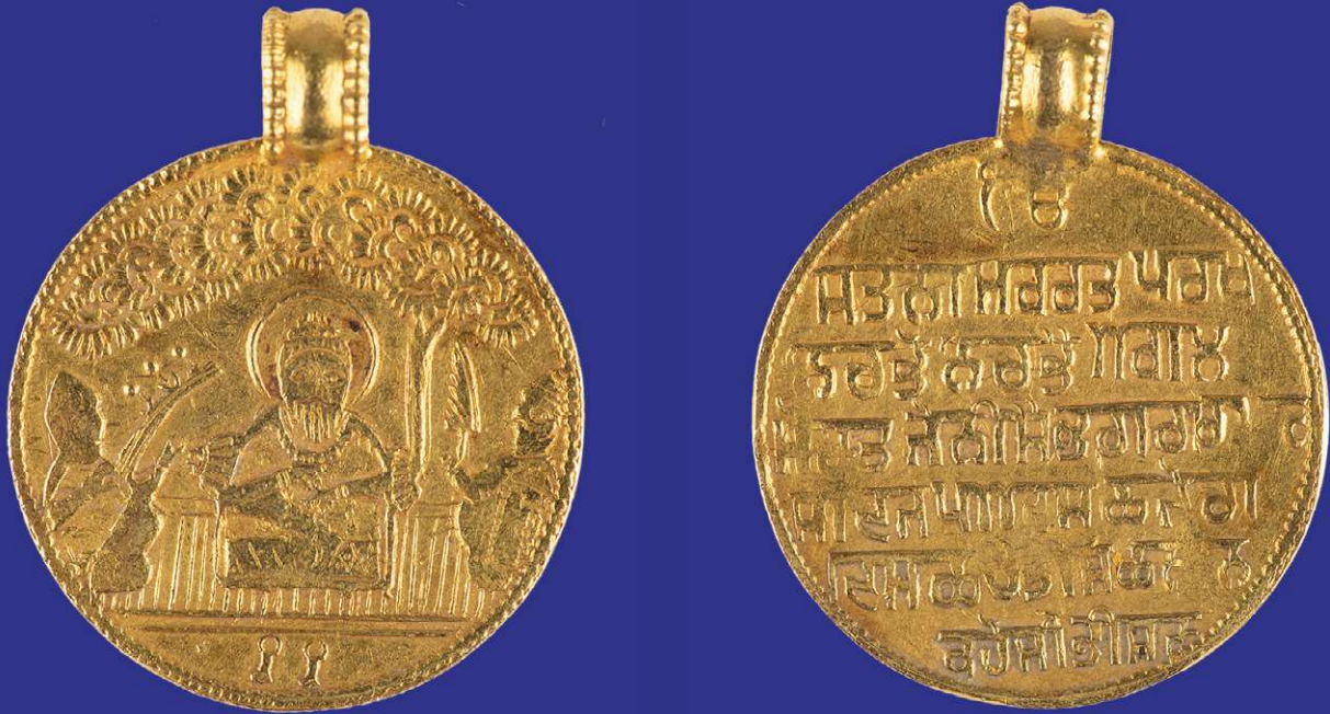
Temple token embossed with an image of Guru Nanak seated under a tree, with the Mool Mantra (a Sikh prayer) on the reverse Punjab, 19th century, Sikh Empire era, Gold. Kapany Collection of Sikh Art.