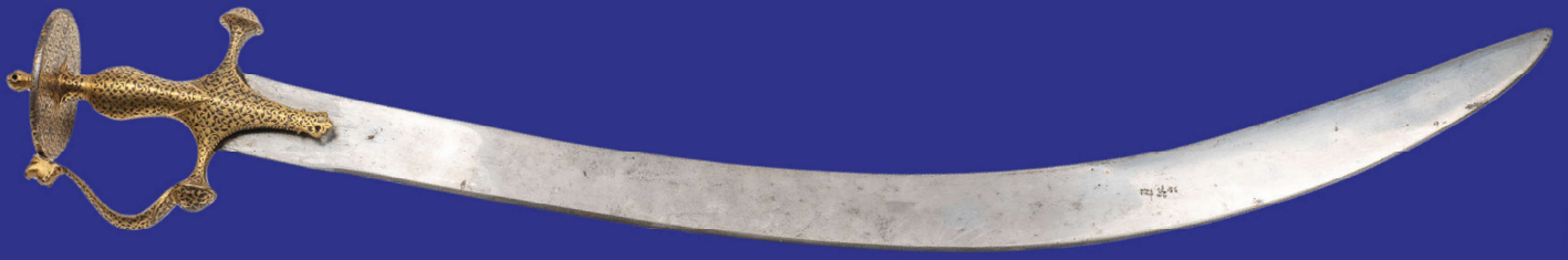
| Inscribed and gold-damascened sword. Punjab, circa 1850. Kapany Collection of Sikh Art. Courtesy of The Sikh Foundation