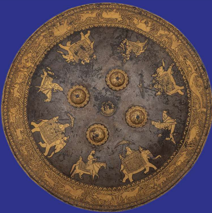
| Shield. Punjab, circa 1835. 42 cm diameter. Kapany Collection of Sikh Art.