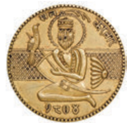
Guru Gobind Singh seated holding his falcon and an arrow, taken, 1747, Kapany Collection.

The Sikh Foundation supports Satnam Sarab Kalyan Trust in Punjab wherein instructions on Sikhism are imparted to over 150,000 school children.