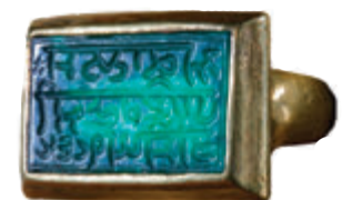
Seal ring of Maharaja Ranjit Singh, Carved emerald set in gold, 1812-1813, Kapany Collection.