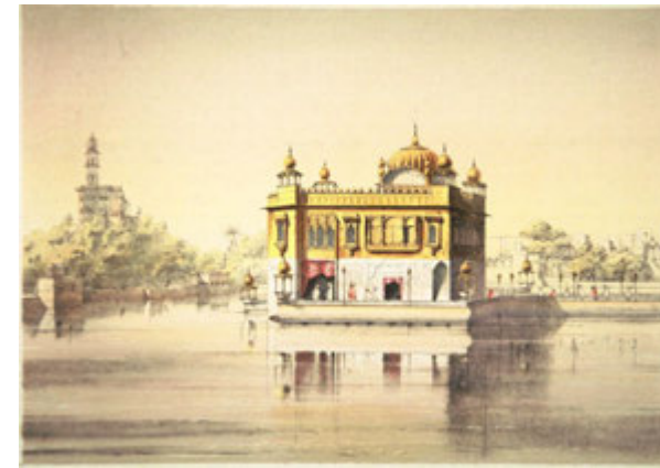
The Holy Temple from Original Sketches of the Punjab by a lady, 1854, Kapany Collection.