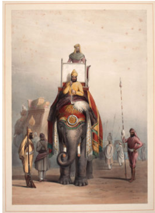
Raja of Patiala on Elephant, chromolithograph by Emily Eden, 1844, Kapany Collection.