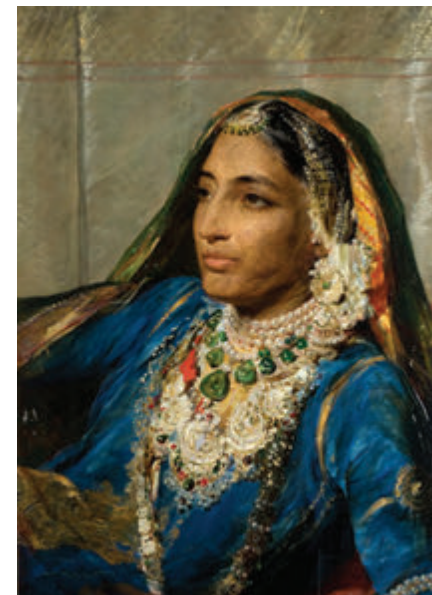
Rani Jind Kaur, oil painting by George Richmond, 1863, Kapany Collection.

The Sikh Foundation has published a dozen books on subjects ranging from religion, history, art and culture of the Sikhs including children's books. It has also published two journals, newspapers, greeting cards and Fine Art posters.