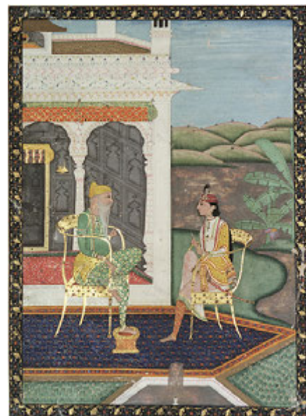
Maharaja Ranjit Singh with Hira Singh, watercolors on paper, 1830, Kapany Collection.